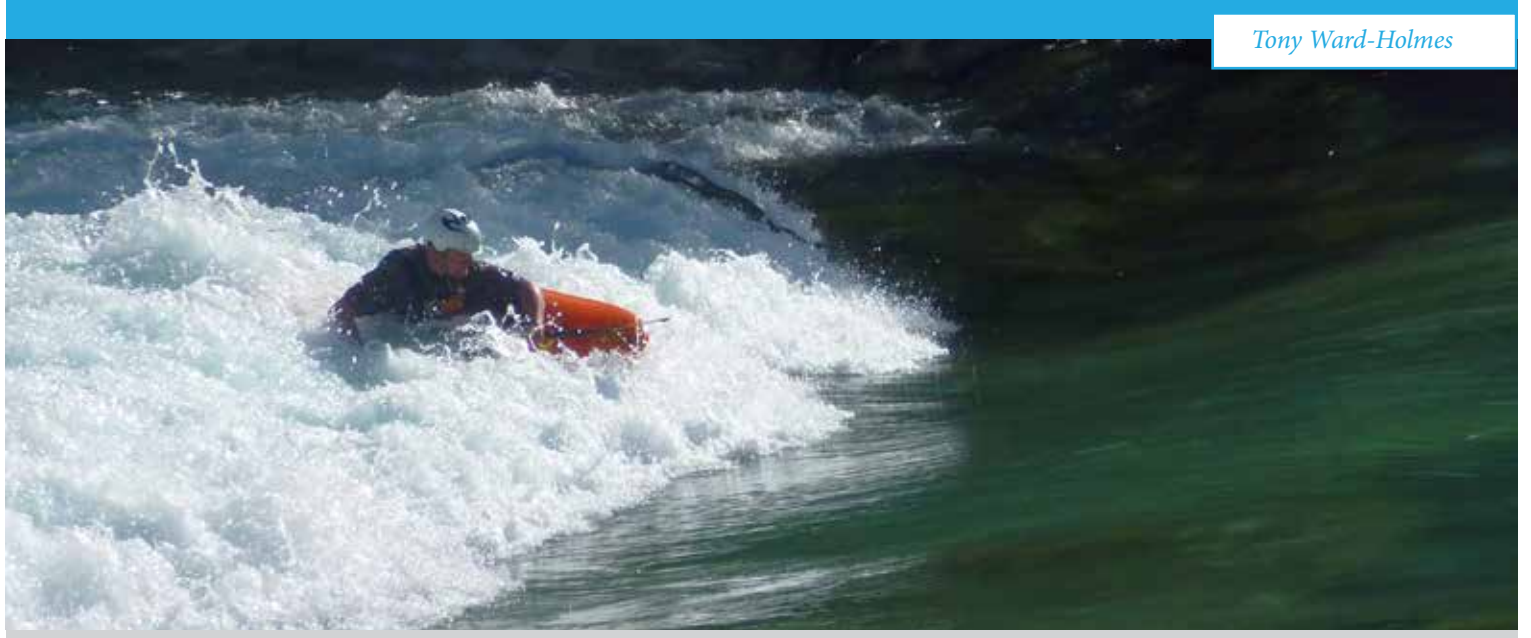
Introducing Aidan Craig, Whitewater NZ's new (co-opted) Education Officer. Here he is winding up for a cartwheel, top-wave on the Hawea.

Building a play-wave seems easy at first thought. You need some water for a start, and some gradient to make that water flow. To shape a wave you need a ramp or a constriction to speed up the water, preferably both. An eddy or two are needed too.. a one-shot wave isn't much use.. and Bob's your uncle, right?