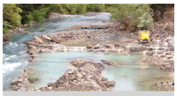
Hawea bottom wave under construction, top wave 100m behind.

taken out and used in construction, and the Ohau was better than either of them. As for the lower Waitaki gorges.. they contained rapids that made Nevis Bluff look small. In the Clutha catchment Molyneaux Falls, Golden Falls and other major rapids vanished under Lake Roxburgh in 1956, followed by The Gap, Bannockburn and the mighty Sargood's Weir under Lake Dunstan in 1992.