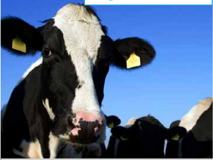
Dairy conversions occur apace across the Canterbury region.

The problem is twofold; there is contamination from intensive farming practices and from cows peeing urine patches onto the ground (most of which the grass can't use) and this ends up as nitrates in ground water and surface water. Faecal coliforms also getting into ground and surface water.